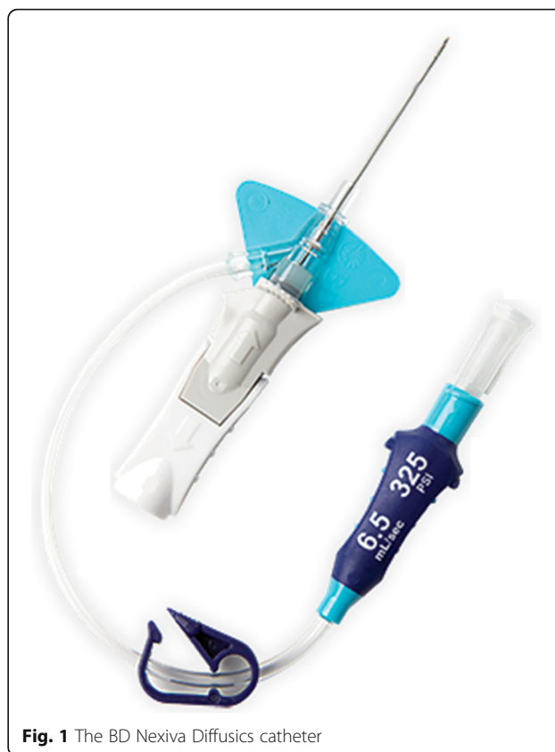
Fig. 1 The BD Nexiva Diffusics catheter

All patients underwent CCTA with a 128 section CT scanner (Siemens Somatom Definition AS) MDCT