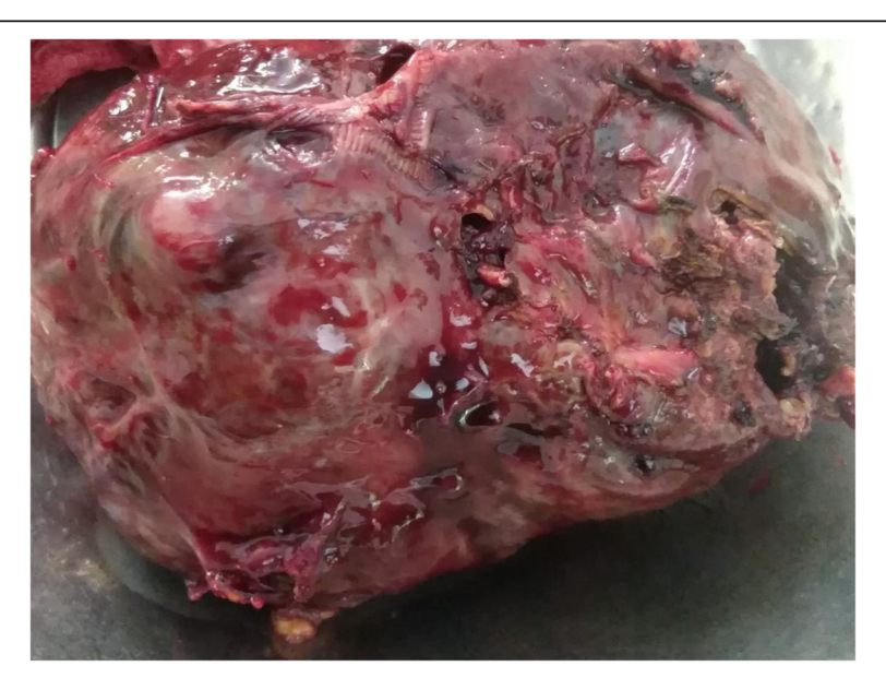
Fig. 2 Post-operative specimen

Leiomyosarcoma arising from gastrointestinal mesentery is a rare but aggressive pathology. A first case report on