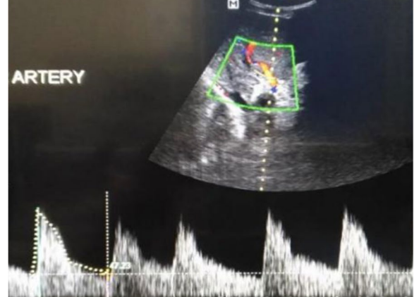
Fig. 3 A Hepatic artery at the porta hepatis in color Doppler study of the same 35-year-old female with chronic liver disease. B Spectral Doppler evaluation of the hepatic artery of the same 35-year-old female with chronic liver disease (PSV=164.27 cm/s, EDV=47.23 cm/s, PI=1.36, RI=0.71, AT=56 ms)