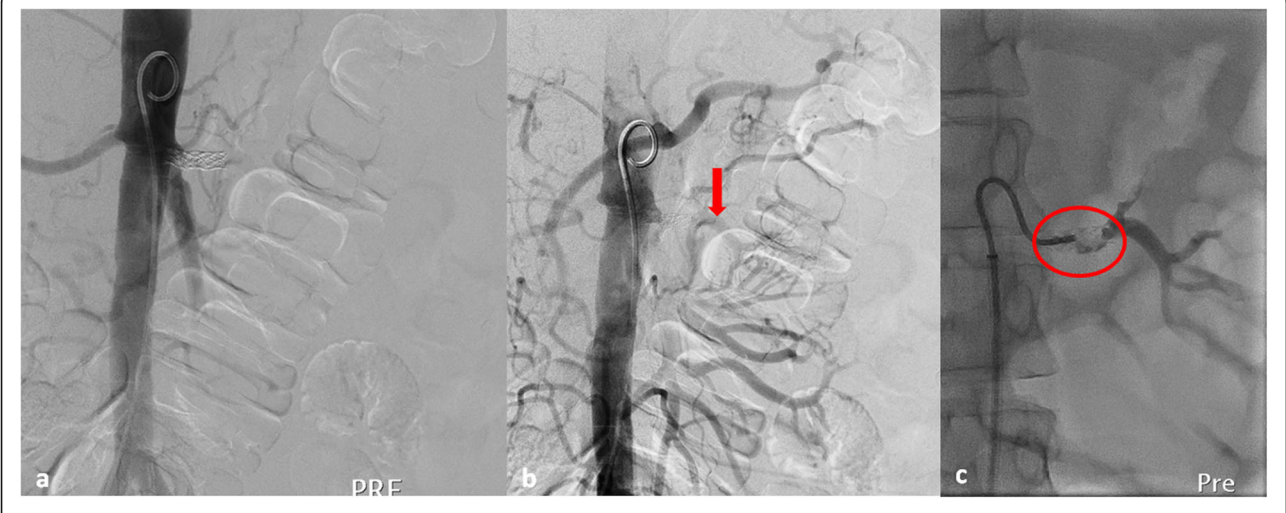
Fig. 1 a DSA at the level of the renal arteries demonstrating bilateral renal artery occlusion. b Delayed phase demonstrating perfusion of the distal renal artery (arrow) from collateral network. c Selective catheterization of the occluded stent and contrast infusion demonstrating in-stent thrombosis with characteristic contrast media feeling defects (circle)