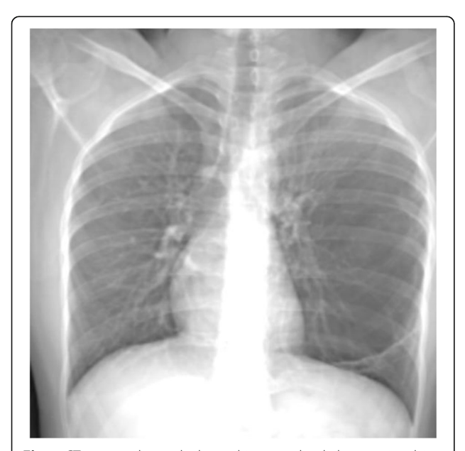
Fig. 1 CT scout radiograph showed increased radiolucency involving mid and lower zones of the left lung with displacement of bronchovascular markings with mild mediastinal to right side

Provisional imaging diagnosis of large bullous cystic lesion with emphysematous changes was made, since she