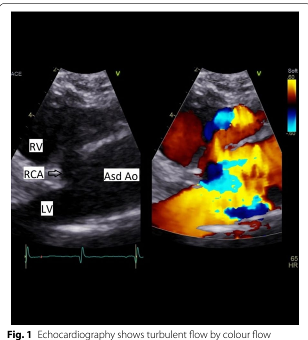
mapping over right coronary artery (RCA) into the right ventricle (RV), suspicious of a RCA fistula

She was managed conservatively with medication and upon discharged, she was given antihypertensives, diuretic, anticoagulant and phosphodiesterase inhibitors. She remained well and asymptomatic for the past one year with regular follow-up in the outpatient clinic. She